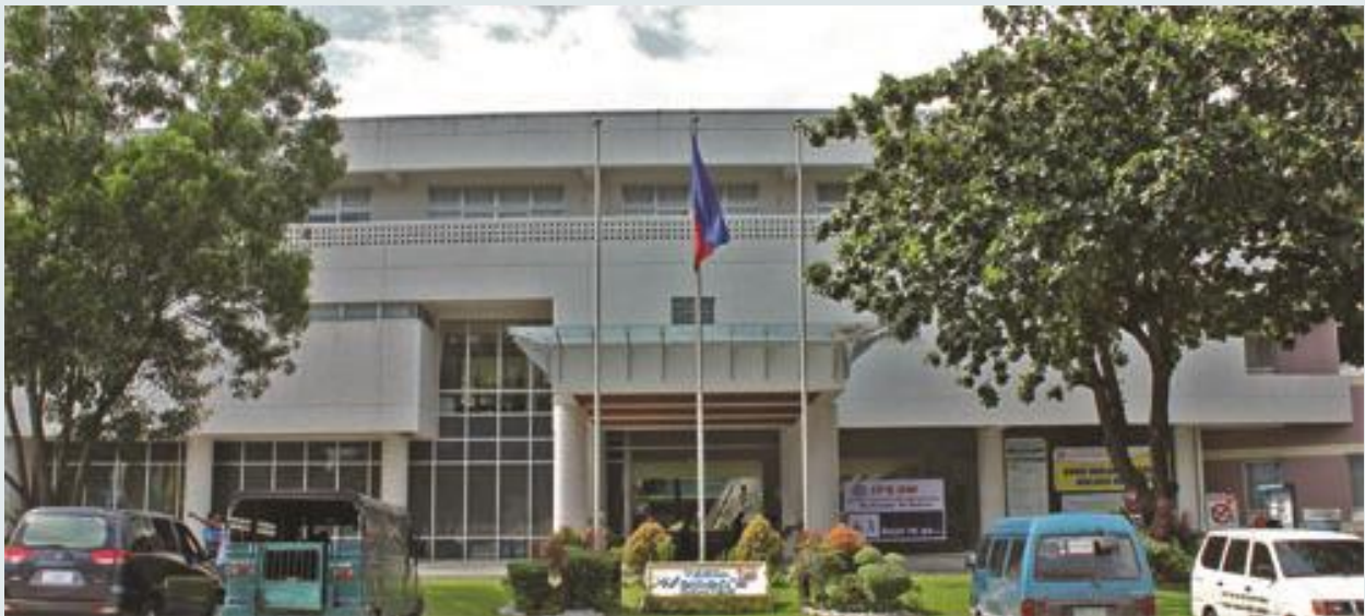
Fig. 5. TESDA Women's Center Façade

TESDA supported TWC in its journey to being recognized as one of the first i-hub implementers worldwide with the intention of better addressing issues and challenges of the current and future labor market of the country, especially in the advent of the 4IR. Being an innovation center, TWC, with the help of TESDA, is expected to help produce more skilled workers.