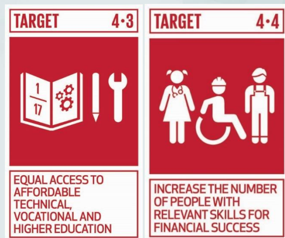
Fig 2. SDGs 4.3. and 4.4

Innovation plays a crucial role in achieving the global Sustainable Development Goal on education—ensuring equal access to affordable and quality TVET for all (SDG 4.3) and increasing the number of youth and adults with relevant skills for employment, decent work, and entrepreneurship (SDG 4.4).